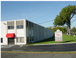
Gamka's 60,000 sq. ft. warehouse is centrally located in Edison, NJ .

Call us for Application Engineering, we have solutions for you. In our 60,000 sq. ft building, Gamka houses a very experienced staff, 30,000 stock inventory items, 1,400 pieces of job proven rental equipment, expert mechanics, with 9,000 parts for equipment and engines in house. We do early deliveries using our own trucks and drivers. Gamka has been a Full Service Construction Equipment and Supplies Provider since 1986, and is family owned and operated, not a chain. Drop by our 2,000 sq. ft. showroom and learn about us.